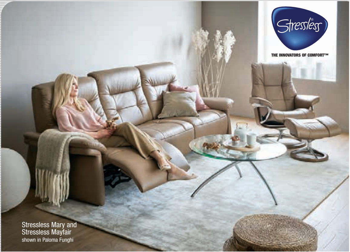
Stressless Mary and Stressless Mayfair shown in Paloma Funghi