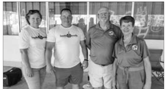
Our team Angus 2020