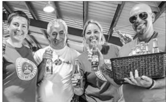
Winning team Angus 2020