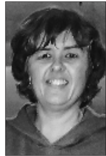
July Birthday Babies