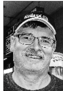
August Birthday Babies