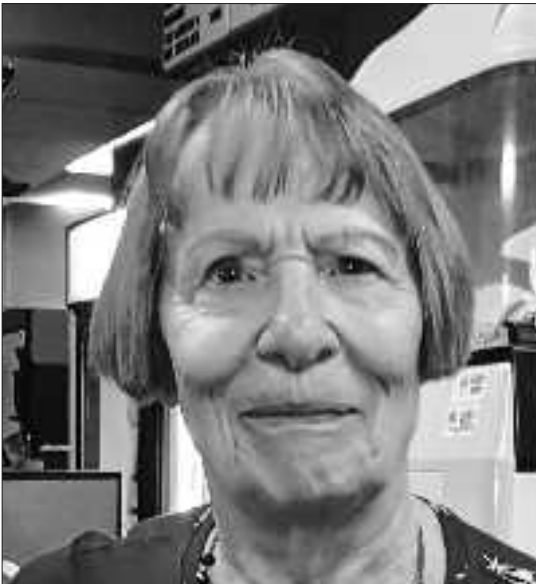
May Birthday Babies

I would normally be talking about our upcoming Play Offs, but like everyone else we have cancelled the rest of our season. Our last day of bowling was March 13th. There will be no Season nor Play Off champs this year as the point difference between our top teams was too close to call. As for our closing banquet on Friday May 1st, we highly doubt this will happen either, but am holding out for a miracle. We have also had to cancel our year end trip to Blyth to the Cowbell Brewery and Liars At A Funeral performance. Until we return to some kind of normalcy, there is nothing else to report.