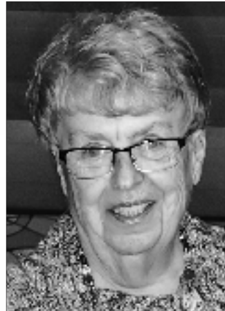
April Birthday Babies