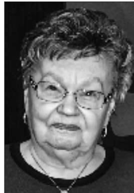
January Birthday Babies