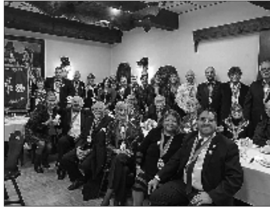
Narrenzunft Concordia 2019/20

Now for the Narrenzunft Members...thank you for everything you do to keep our Group alive!! Everyone has an integral part in the Narrenzunft family ♥