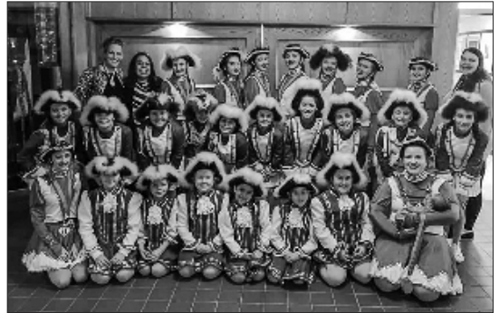
Kinder, Junior and Senior Garde