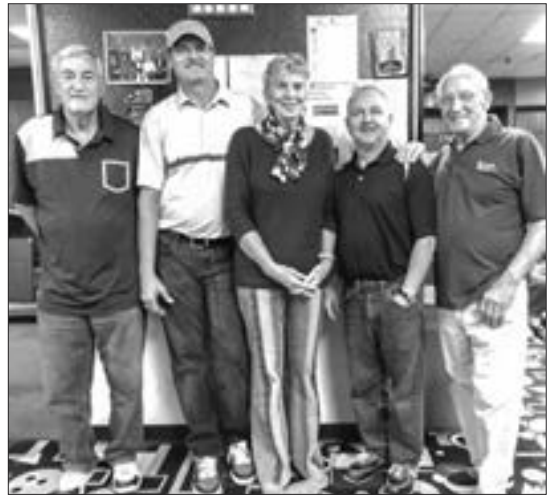
August Birthday Babies