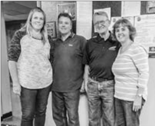
July Birthday Babies