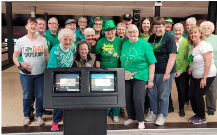
HAVING FUN CELEBRATING ST PATRICK'S DAY!`